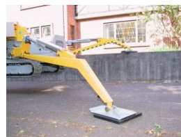
Easy set up