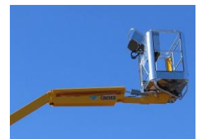
Fly jib (option)