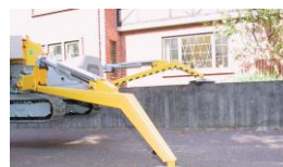
Easy set up